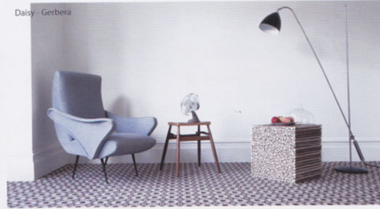
Daisy - Gerbera

tile-like floral with repeated rows of large and small flowers in shades recalling different varieties of Daisies.