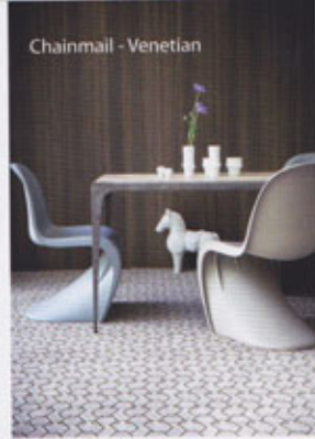
Chainmail - Venetian