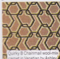
Quirky B Chainmail wool-mix carpet in Venetian by Ashley Hicks. £95.85 per sq m ( alternativeflooring.com )