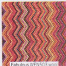
Fabulous WFN503 wool carpet in Ruby. £140 per sq m ( crucial-trading.com )