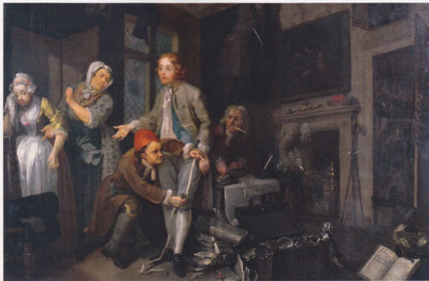
Sir John Soane's Museum

Closer to town, Focus/14 also opens on Sunday at the Design Centre, Chelsea Harbour, SW10 (020-7225 9166; www.dch.co.uk ). This is an action-packed four-day programme of talks and events, full of opportunities to hear direct from the designers. On pages 122-126, we give a sneak preview of some new product launches.