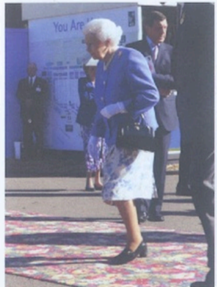
Queen Elizabeth on Flowers of Thorpe at RHS Chelsea Flower Show 2017.