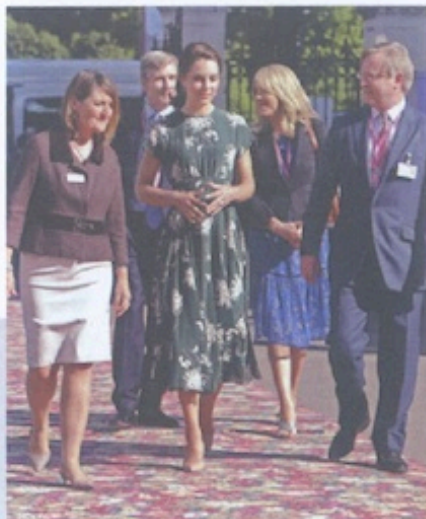
Duchess of Cambridge on Flowers of Thorpe at RHS Chelsea Flower Show 2017.

"It is fabulous to see great British brands coming together, to celebrate great British craft, pattern and flowers."