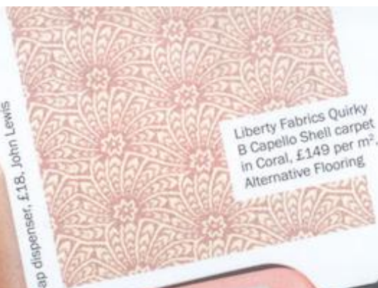
Liberty Fabrics Quirky B Capello Shell carpet in Coral, £149 per m 2 , Alternative Flooring