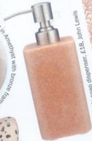
Pink marble soap dispenser, £18, John Lewis