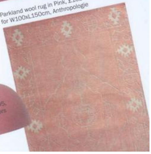
Parkland wool rug in Pink, £168 for W100xL150cm, Anthropologie