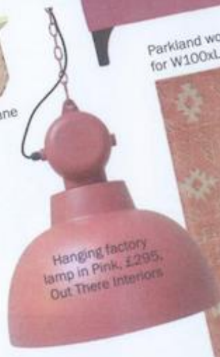
Hanging factory lamp in Pink, £295, Out There Interiors