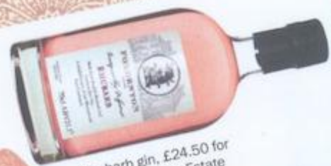
Rhubarb gin, £24.50 for 70cl, Foxdenton Estate