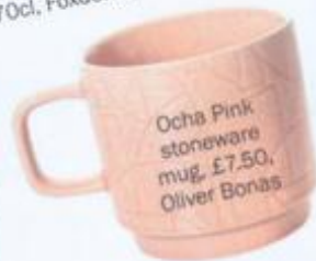
Ocha Pink stoneware mug, £7.50, Oliver Bonas