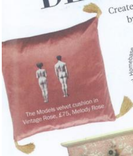
The Models velvet cushion in Vintage Rose, £75, Melody Rose

Create a restful retreat or make a sophisticated statement by accessorising with our pick of on-trend pinks