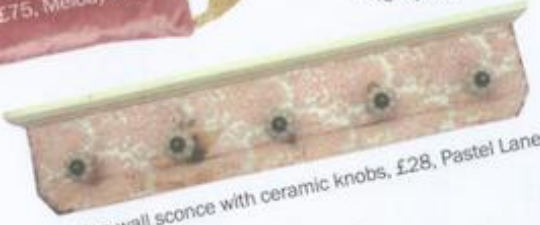
Wooden wall scone with ceramic knobs, £28, Pastel Lane