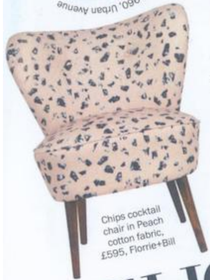
Chips cocktail chair in Peach cotton fabric, £595, Florrie+Bill