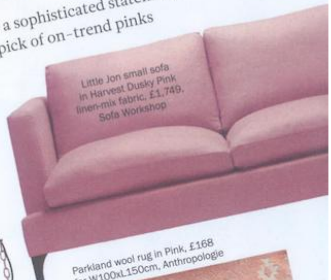
Little Jon small sofa in Harvest Dusky Pink linen-mix fabric, £1,749, Sofa Workshop