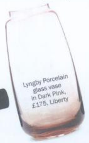
Lyngby Porcelain glass vase in Dark Pink, £175, Liberty