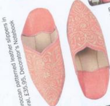
Moroccan patterned leather slippers in Coral, £35.95, Decorator's Notebook