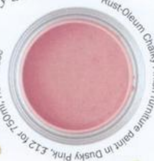
Rust-Oleum Chalky Finish furniture paint in Dusky Pink, £12 for 750ml, Homebase