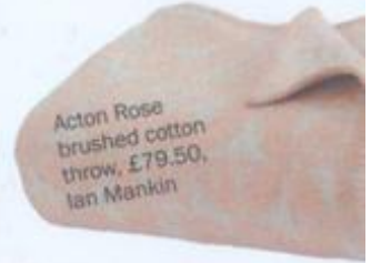
Acton Rose brushed cotton throw, £79.50, Ian Mankin