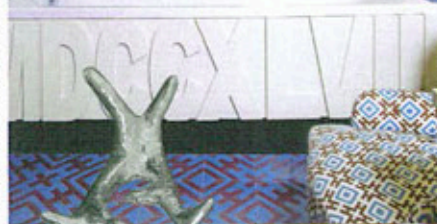
8 Coral nickel handle, £118, Ashley Hicks 9 Wye wool-mix carpet, £180 per sq m, David Hicks by Ashley Hicks at Stark Carpet 10 X-Frame leather ottoman, £2,585, Ashley Hicks