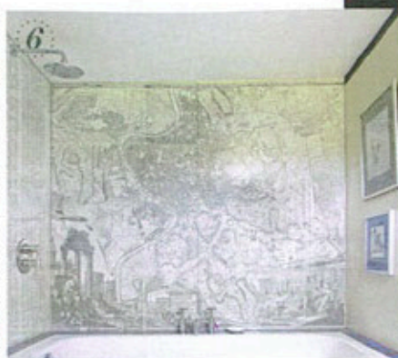
6 In this Oxfordshire bathroom, Ashley designed a glass-covered wall with a print of Giambattista Nolli's 1748 map of Rome 7 Ashley placed brass detail against a black stained-oak door in this Notting Hill home

Find out more about Ashley's work at ashleyhicks.com , or follow him on Instagram @ashleyhicks1970