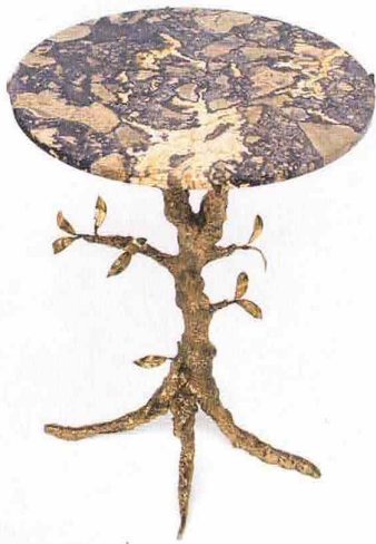
Bronze Vine Root side table in polished bronze with warm gilt lacquer base and marble top, £11,280, Cox London