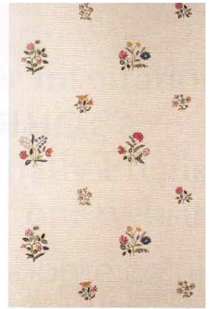
Daffodils & Bluebells fabric, a metre, Chelsea Textile