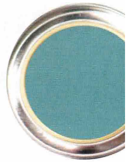
Blackbird Egg paint, £25 for Pure Matt, Fenwick & Tilb