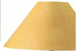
T3-031 Small Tea Caddy table lamp, hand-painted or decoupage, £357, Besselink & Jones

Bring a refined touch to elegant schemes with pretty yet sophisticated designs inspired by nature. Seek out soft colourways to instil a gentle mood or, for a more contemporary setting, neutrals or shades of grey lend a fresh feel to country themes, whilst layering print on print creates a timeless country style. Within a more polished scheme, look to furnishings or details with hand-painted motifs or that capture natural shapes in classic materials, such as marble, wood and metal.