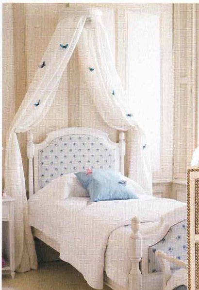
Children's Lucian bed, from £2,644, Leporello