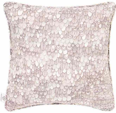
Bird cushion cover, £95, Abigail Edwards