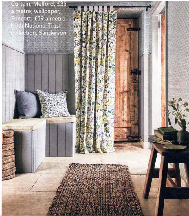
Curtain, Melford, £35 a metre; wallpaper, Fencott, £59 a metre, both National Trust collection, Sanderson