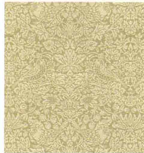
Quirky B Liberty Fabrics Strawberry Meadow Acanthus patterned carpet, £149 a square metre, Alternative Flooring